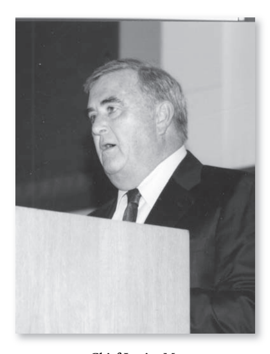
Chief Justice Murray

Citing Pericles' 430 BC funeral oration for the dead soldiers of the Peloponnesian Wars: "Our Constitution is called a democracy because power is in the hands not of a minority of the people but of the whole people", he traced the rule of law forward from the first hazy conceptual embryo of a formal law to the post-Homeric age. "It was in the ensuing Hellenic world," he continued, "when the first efforts were made to inscribe in permanent and public form rules which formally had the more insubstantial status of custom. That